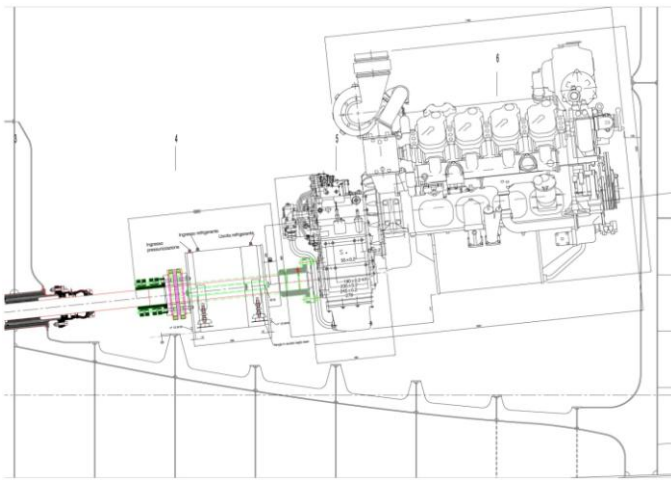
Fig. 1. Hybrid system installed onboard a 25 m lft yacht.

The hybrid system presented at the fair of fishing Ancona consists of a diesel engine and an electric motor with high torque and low speed, keyed directly on the propeller. This electric motor can function as a propulsion engine or electric generator, so at sea, with the internal combustion engine, it will provide electricity on board, allowing to keep off the traditional generator, saving in maintenance, fuel and pollution. The electric motor used as propulsion engine can be used to navigate at low speeds using conventional generators and / or batteries. In this case it creates a propulsion system or a reliable emergency power system, additional to the main engine.