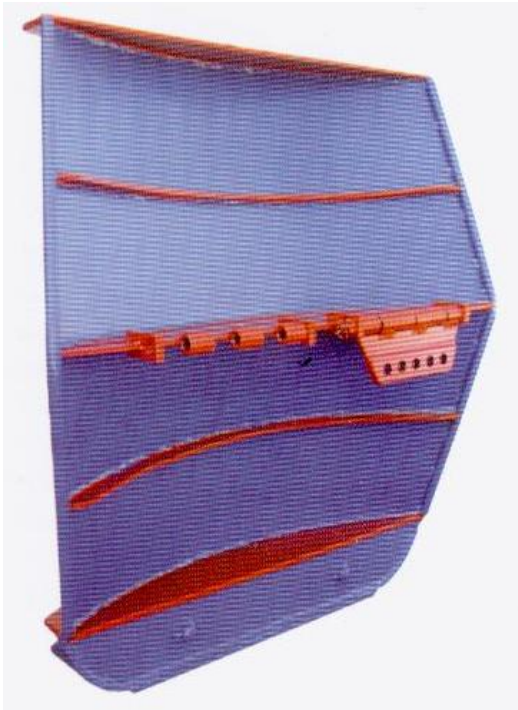
Fig. 4. B-Side otter boards.