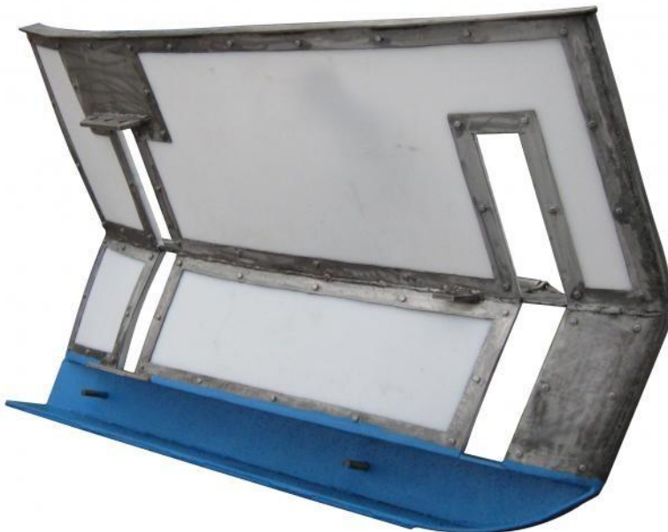
Fig.3. AR otter board with polyethylene.

To address these issues work has been done on the classic model, AR, without affecting its performance. replacing most of the sheet steel with polyethylene, a plastic material highly resistant but little weight. we obtained a weight reduction of 35% in water reaches 60%.